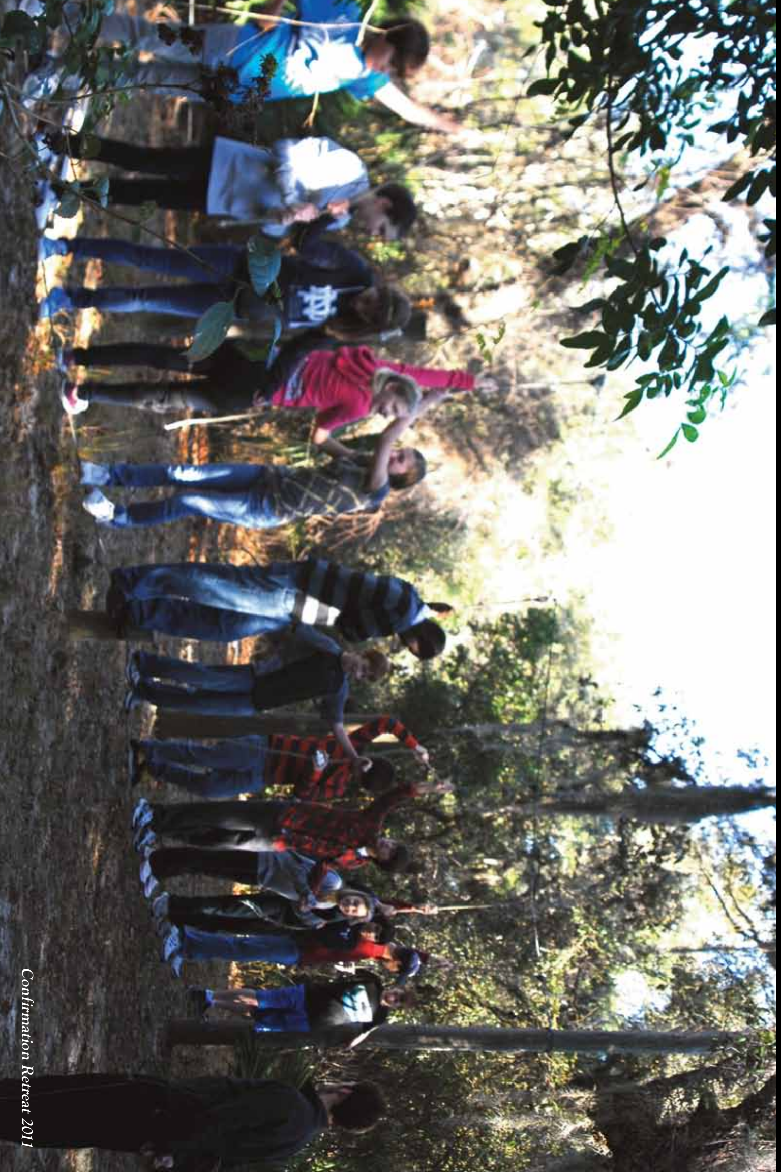
Confirmation Retreat 2011