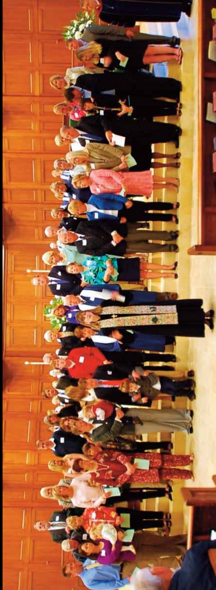
New Members - January 23, 2011