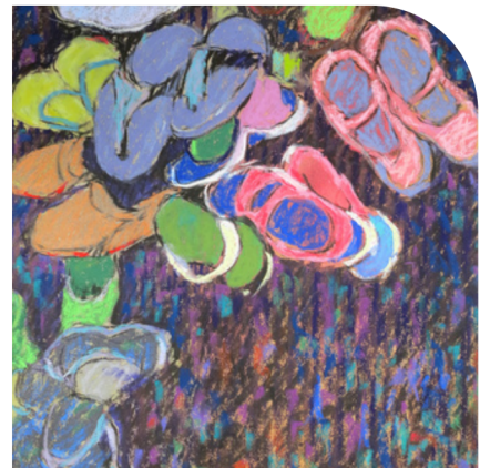
"Beach Shoes in the Foyer"

In 2011 his pastel painting of a chef at the grill received the 24th Annual A. Brittain Banghart award for Drawing, Painting, Etching, or Sculpture Depicting the Human Figure from the Academy Art Museum in Easton, MD. In 2015 and 2017 he received First Prize in Pastel Painting at the Vero Beach Museum of Art, Art-By-The-Sea Exhibition.